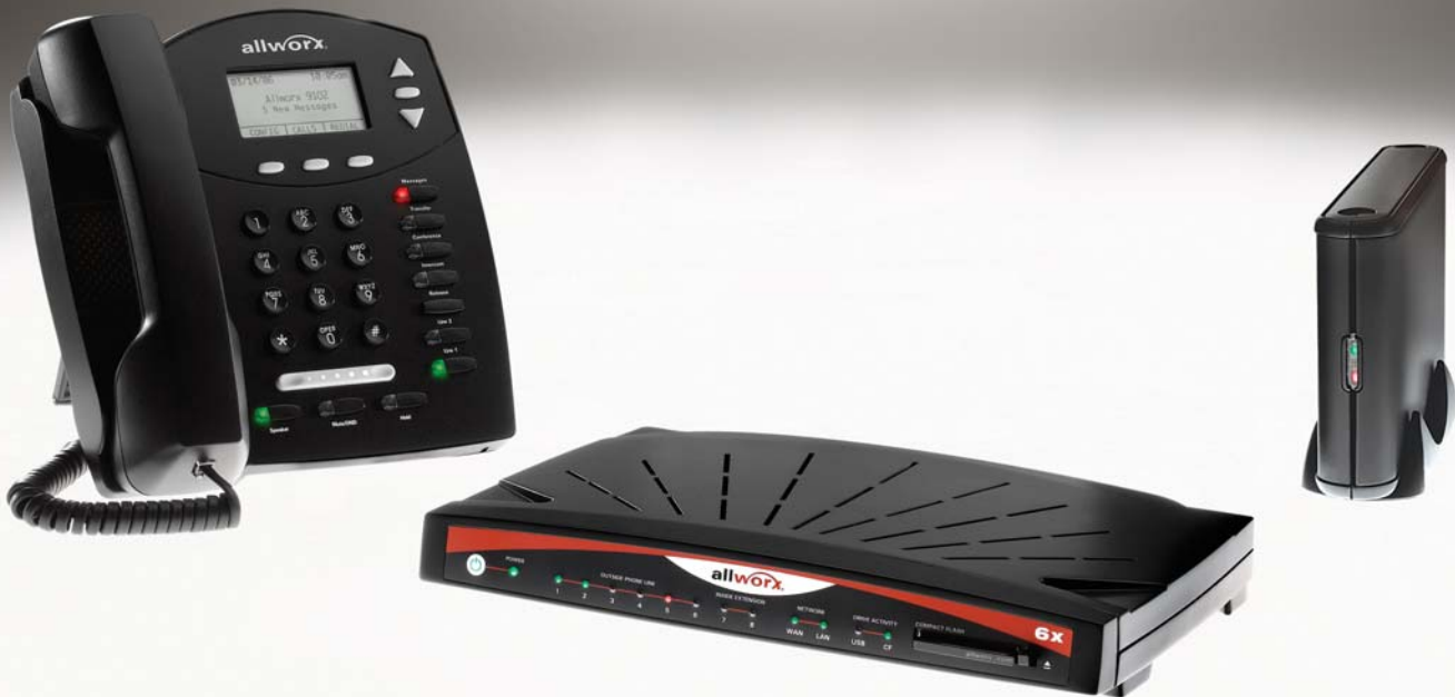
The Allworx 6x System, shown with Allworx 9102 phone and optional USB hard disk.