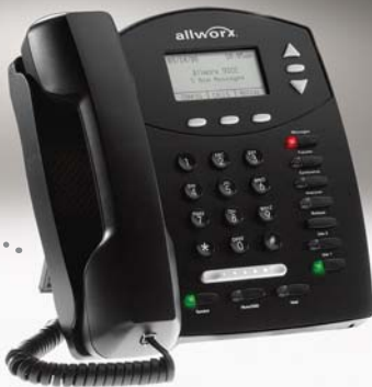
Allworx 9102 VoIP Phone