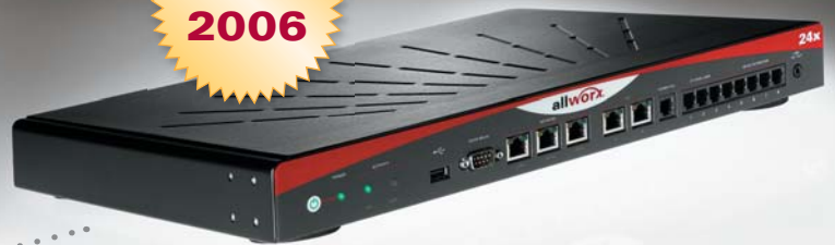
Allworx 24x System