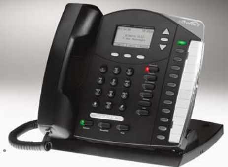
Allworx 9112 VoIP Phone