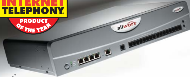
Allworx 10x System

2005 INTERNET TELEPHONY PRODUCT OF THE YEAR