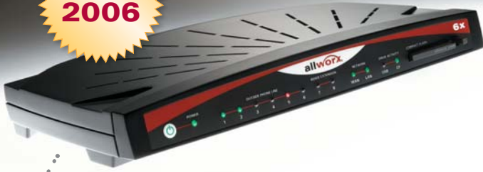
Allworx 6x System

2005 INTERNET TELEPHONY PRODUCT OF THE YEAR